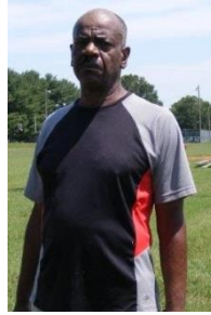
8-19-17 WP CLD 1 st