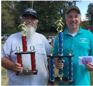
2017 CL 40 B 1 st Gauger 2 nd Smullen (orig. Mixed CL)