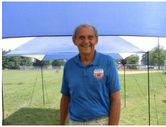
8-19-17 WP CLA Gray