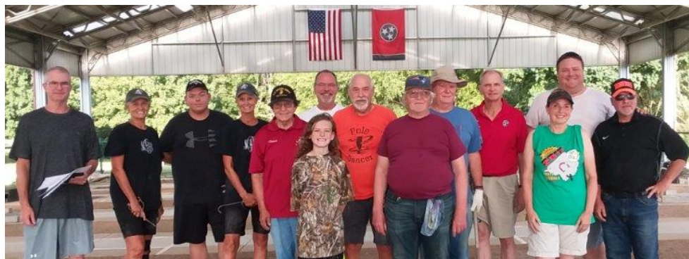
8/20/21 Group Pic. Clarksville