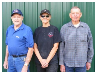
5-2-15 CL C 3 rd Lotz 1 st Griffith 3 rd Conner