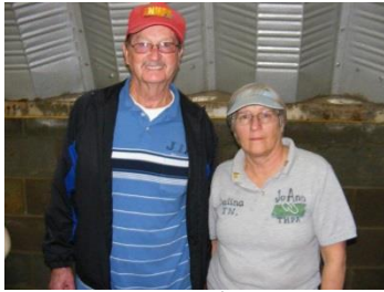
3-4-17 MG CL A 1 st Stanford 2 nd Cooper