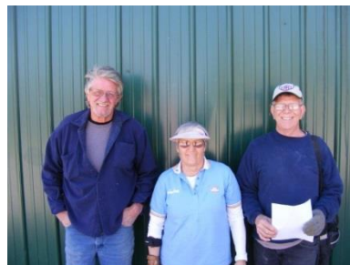
4-2-16 CR CLC 1 st B. Brand 2 nd Stanford 3 rd Merle South