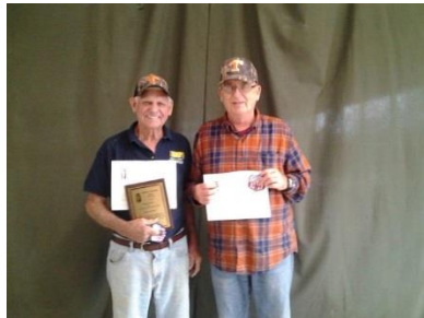
Fields and Farnsworth