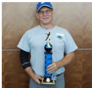
E. SOUTH 2 nd Place