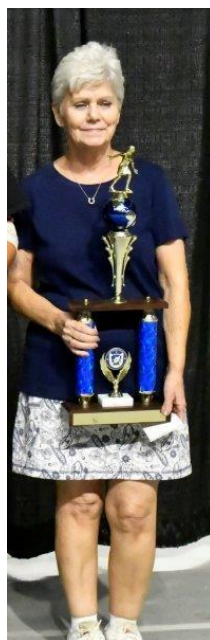
2018 WT 3 rd Place