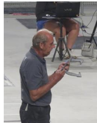
7-28-18 RS CLA 1 st C. Gray 2 nd Lawrence Osborne (NoPic)