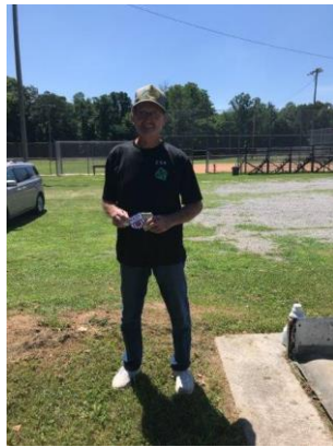
06-06-18 WP CLA