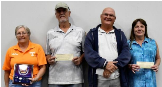
2017 Horseshoe Tour CL I 1 st Stanford 2 nd Henderson 3 rd Carson 4 th Lanfair