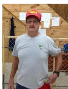
11-7-15 MG 1st Cooper Tourn Champ