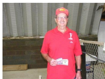
11-14-15 MG CLA 1 st Cooper