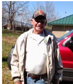
4-4-15 Tourn. Champ B. Fields