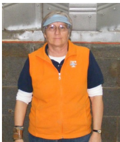
3-14-15 CL B 1 st J. Stanford